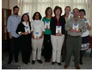
Caption: English Language Fellows during their in-country orientation on September 28, 2006 in Ankara, Turkey holding up their first mutual understanding resource: a book explaining American culture written by a young Turk.

introduced and distributed. ELFs also had the opportunity to meet the board members from the English Language Education Association in Turkey (INGED) to discuss future collaboration. The in-country orientation was capped off by an extremely valuable Turkish language and culture workshop provided by the Turkish American Association.