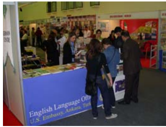
Caption: Visitors at the English Language Office during the 25 th Annual International Book Fair in Istanbul October 28- November 5, 2006.